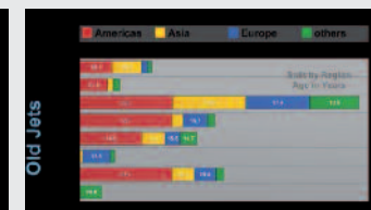
Old jets by region Age in years